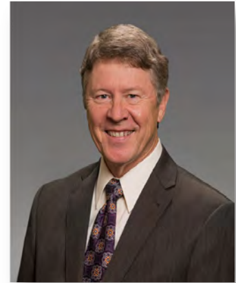
Judge Emmett, Harris County Judge

A member of the Texas House of Representatives from 1979 to 1987, Judge Emmett was chairman of the Committee on Energy, a member of the Transportation Committee, and represented the state on numerous national committees relating to energy and transportation policy.